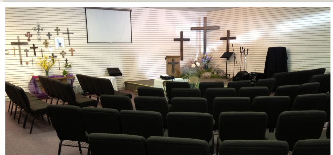
Hope Community's Worship Location and base of operations is on Main St. in Frankenmuth in the Bavarian/Kroger Mall, where just about everyone in this area goes at least once per week.