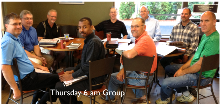
Thursday 6 am Group

We want to give you an update on what's been happening with us, and with our ministry endeavors. As you might remember we started a new chapter in our lives in 2012 when we launched a ministry called Start Where U R--see the last page for a the vision of that ministry. Part of the outflow of that vision led us to join a group from our area in launching Hope Community Church. The two ministries really have the same goal: to help and support the Jesus follower movement during whatever time our Lord has left for us here on this earth. We wanted to share an update with pictures and stories about both: